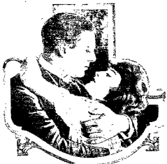
THOMAS MEIGHAN and MARTHA HANFIELD in a scene from "CIVILIAN CLOTHES" - A PARAMOUNT PICTURE