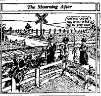
The Morning After