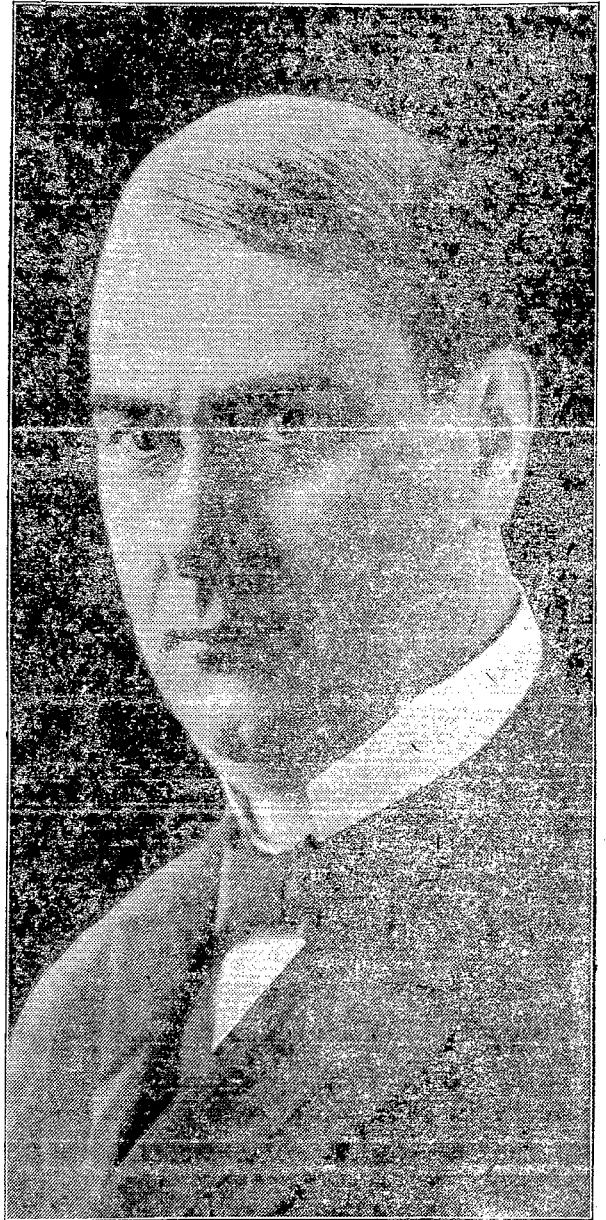
A FRIEND OF THE PEOPLE

"HOPE for the people lies in the kingdom of God now at hand. Millions are now living who will see that kingdom in operation and if obedient to its righteous laws will never die, but will live on earth forever in happiness, peace and prosperity. The world's darkest hour is just before its greatest blessing."